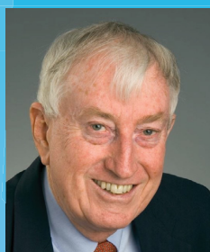
An Interview with Laureate Professor Peter Doherty AC