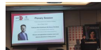
SA Scientific Meeting

Tasmania ASMR Medical Research Week® Virtual Symposium , held on June 11th.