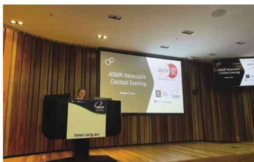
Newcastle Networking Event