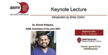
Qld Postgraduate Student Symposium