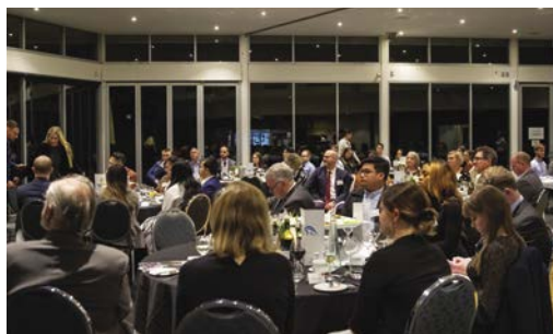
SA Gala dinner