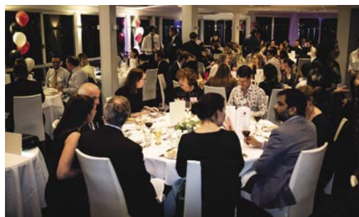
WA Gala dinner