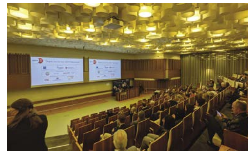
Qld Gala dinner