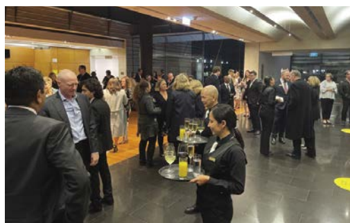
NSW Gala dinner