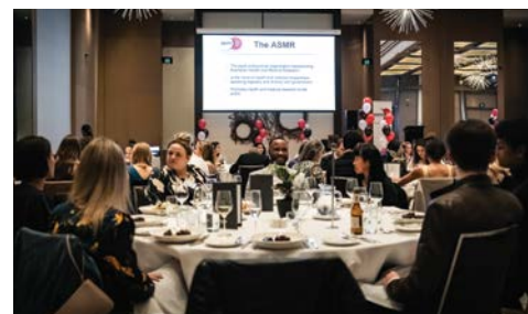
ASMR MRW ® Gala dinner Perth