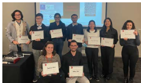
ASMR MRW ® Victoria