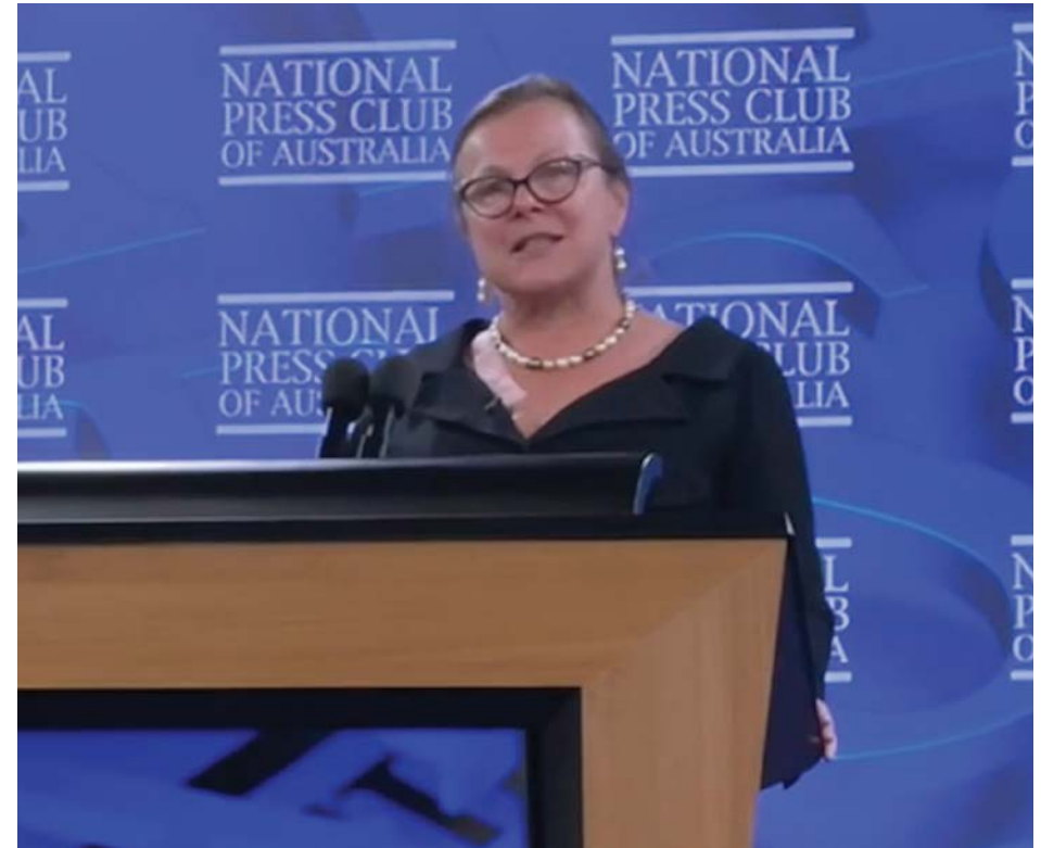
Professor Fiona Wood speaking at the National Press Club

I would like us all to see the value of medical research and collaborate on how to embed this in all parts of our health system. It might be easy to see this as an impossible task and to walk away. But that's not the way to strive for excellence and that's not