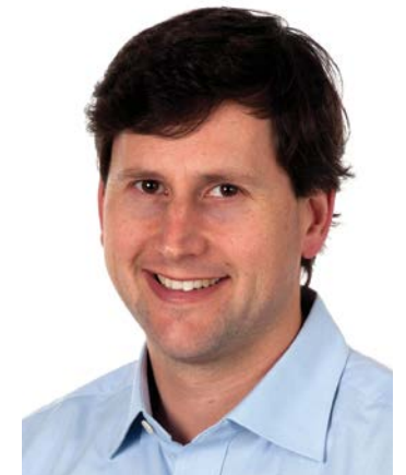
Professor Bruce Campbell

This treatment is now recommended in guidelines globally and is standard practice. The EXTEND-IA TNK multi-centre randomised trial (Campbell et al. New England Journal of Medicine 2018) was the paper submitted for the Leading Light award and established a genetically modified tissue plasminogen activator tenecteplase was more effective in restoring brain blood flow than the traditional agent alteplase. Part 2 of the trial (JAMA 2020) established the preferred dose of tenecteplase. As a result, tenecteplase has entered treatment guidelines in the US, Europe and Australia as an alternative to alteplase.