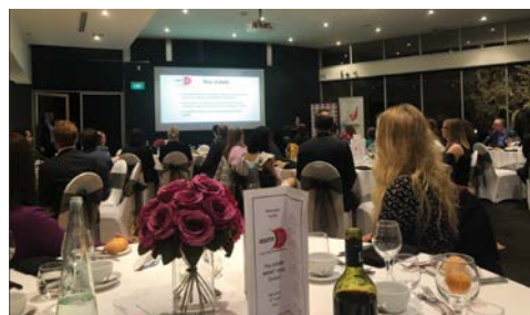
ASMR MRW ® Gala Dinner South Australia