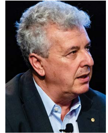
Professor Leon Flicker AO

There have been major strides in our understanding of risk factors and diseases that produce decrements in intrinsic capacity. We also have increased knowledge about which environmental changes are required to make our world more age-friendly. Our greatest challenge is integrating many disparate interventions for individuals, including appropriate medical and social services. The risk is that we will waste precious resources on innovative but ultimately futile activities that will never actually benefit the older people for whom they are targeted. There will be no single silver bullet here. Instead, we already have a large armamentarium to choose from, one that is expanding rapidly. We now need to learn how to effectively direct the appropriate interventions to the right people to allow people to reach a healthy old age.