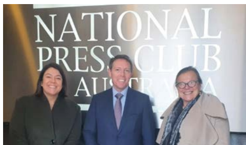
ASMR National Press Club