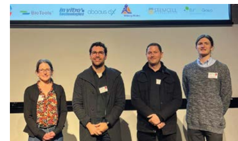
ASMR MRW ® Hunter Region Satellite Meeting