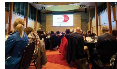
ASMR MRW ® Gala dinner NSW