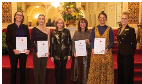
ASMR MRW ® Tasmania

at the University of Tasmania and Government House and Gala Dinner , The Old Woolstore, held on June 10th.