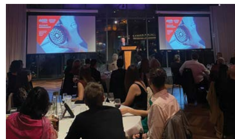
ASMR MRW ® Gala dinner Queensland