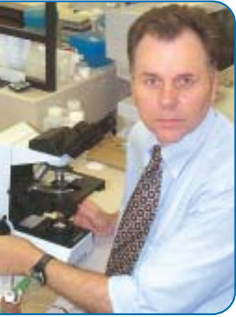
Dr Barry Marshall Research Professor of Microbiology, University of WA